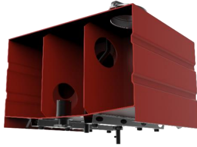
Only sample Picture

3.1. The tank to be mounted on the vehicle will have a capacity of at least 5000 liters with the material of Stainless Steel 304 L