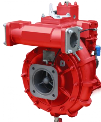
Only sample Picture