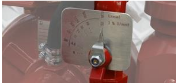
Only sample Picture

6.1. Foam proportion will be installed manual around the pump for foam proportioning. This system operates on principle of measuring pump and foam concentrate flow rate adjusts the foam mixing device to desired foam flow rate according to selected proportioning rates between 3% to 6% The foam/water solution will be discharged from all outlets of the vehicle. Foam mixing system will be made of corrosion resistant gunmetal and 316L grade stainless steel. Foam system is also capable of using foam from external source if required, suction capacity of external foam suction is 2 meters.