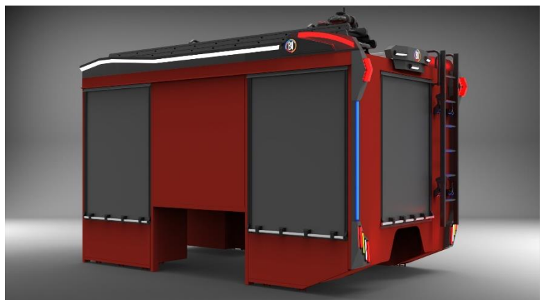
Only sample Picture