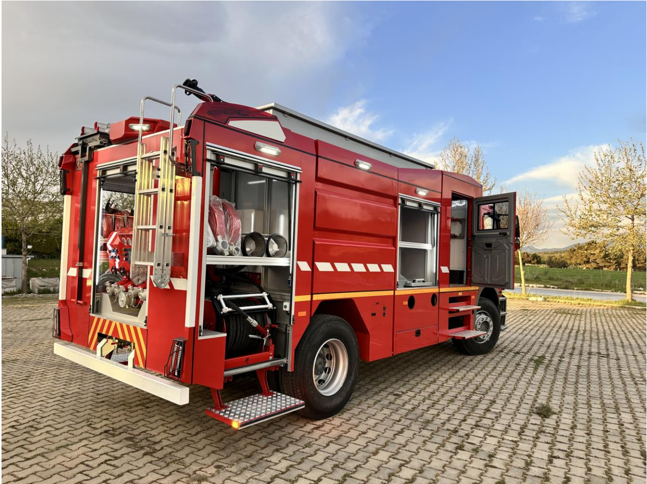
Only sample Picture

SUBJECT: This technical specification covers the technical specifications of the Medium Type Fire Truck with Water and Foam Tank, which will be used in the service of its facilities, with EN 1846 Certificate and in accordance with the norm of 2006/42 EC Machinery Directives.