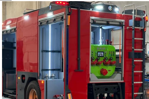
Only sample Picture

11.1 Superstructure electrical system will be supplied from chassis truck electrical system.