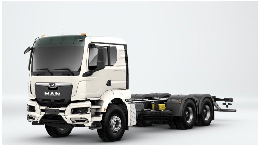
Illustration can deviate