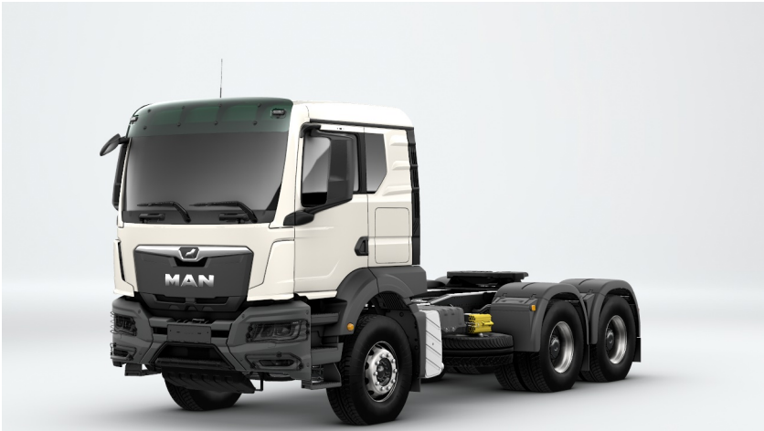
Illustration can deviate