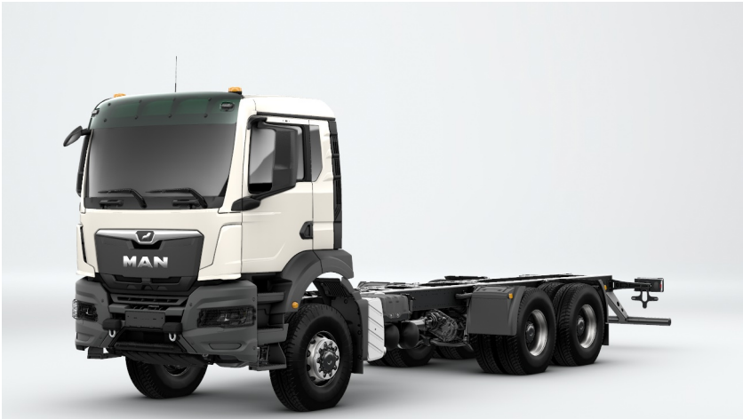
Illustration can deviate